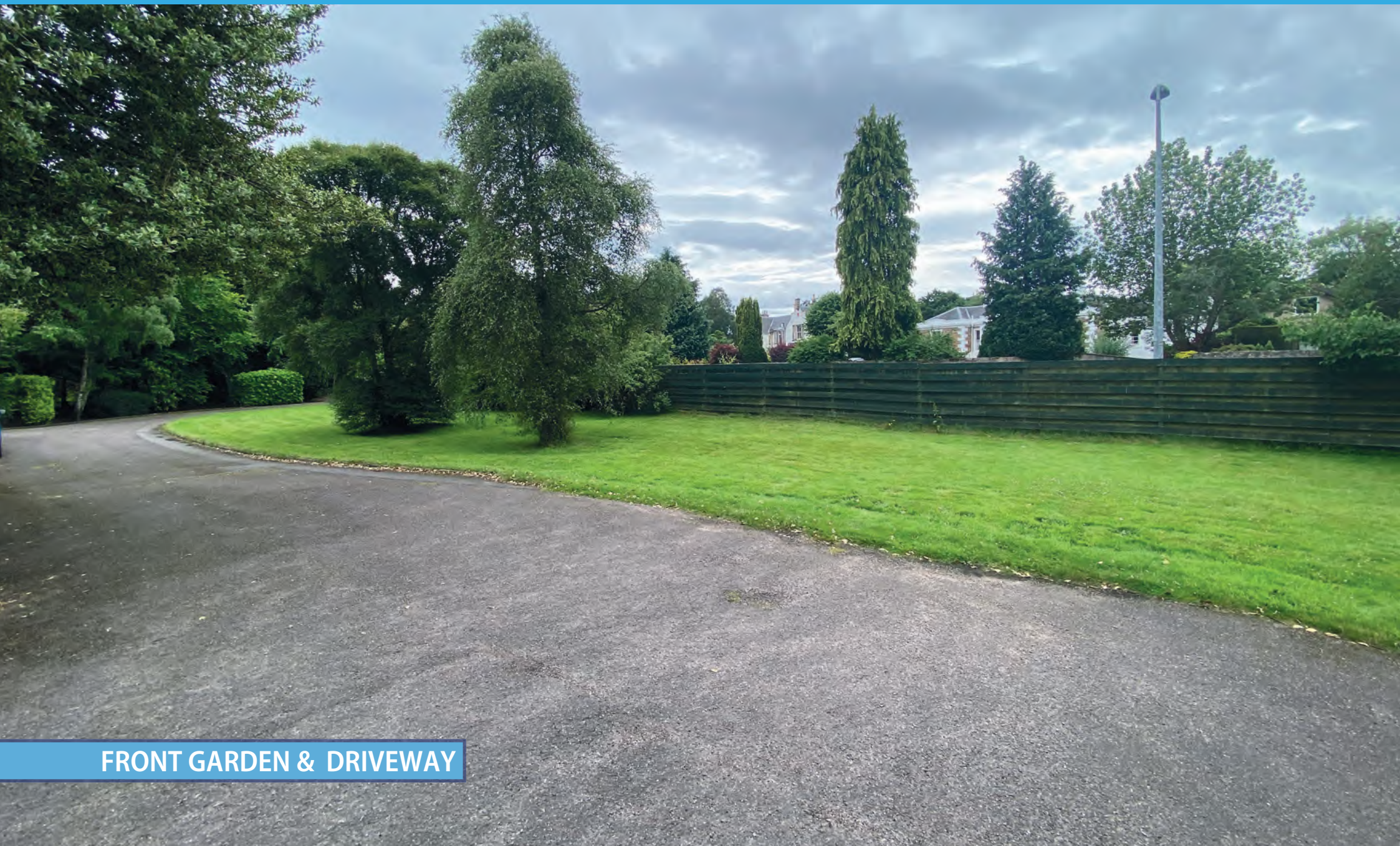
FRONT GARDEN & DRIVEWAY